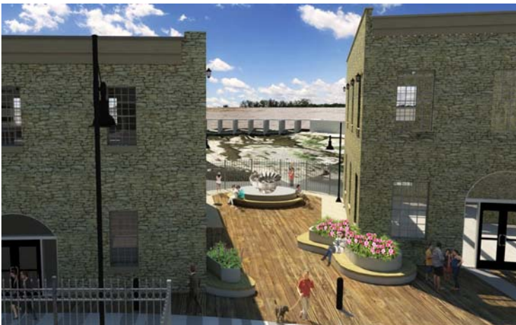
Falls Viewing Platform