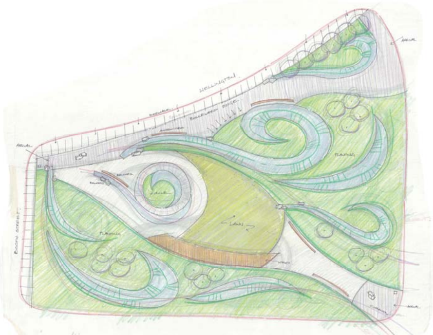
Proposed theme of "Harmony" for interim green space

This site will feature extensive landscaping to produce an intriguing contoured land form design known as "land art". While children play in long, winding land form sculpture representing